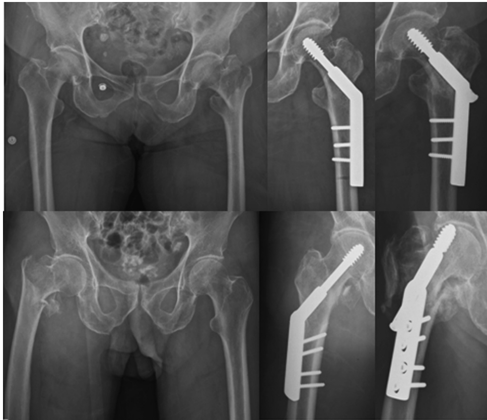
Fig. 1. (Case 1) A stable left intertrochanteric fracture with an intact lesser trochanter that was treated using a sliding compression screw. The fracture healed uneventfully within 3 months. (Case 2) An unstable right intertrochanteric fracture with a displaced lesser trochanter that was treated using a sliding compression screw. The cutout of the lag screw with nonunion was made at 3 months.

elderly patients fell. Accordingly, protective methods against low-severity fractures could be developed. Therefore, the treatment success rate of elderly patients with intertrochanteric fractures might be further increased.